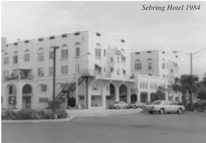
Sebring Hotel 1984