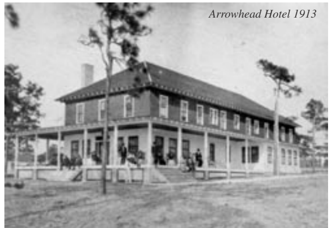
Arrowhead Hotel 1913